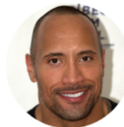
Dwayne 'The Rock' Johnson